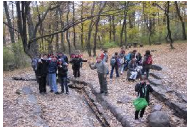
Tracking and hiking